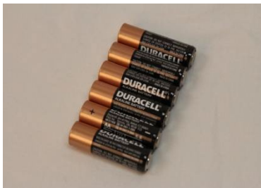
6 AA batteries