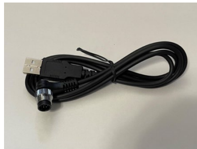
GMAX USB charging cable