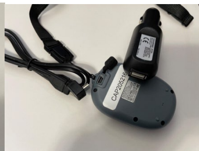
Bad Elf, USB charging cable and 12V USB charger