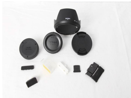
Spare Parts in Small Ziplock Bag