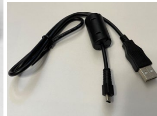
Nikon/Computer USB data cable