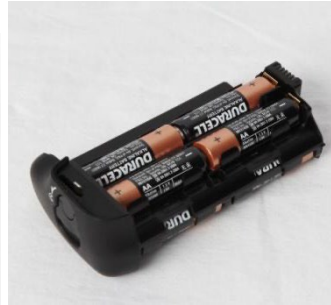
AA battery fixture