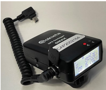
GMAX GPS for camera