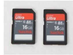
2 SD Cards