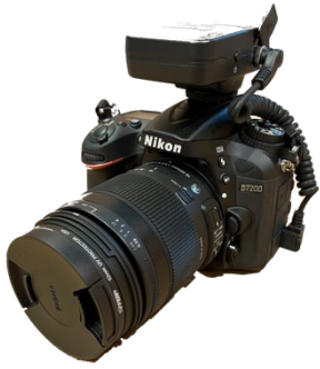
Camera with attachments