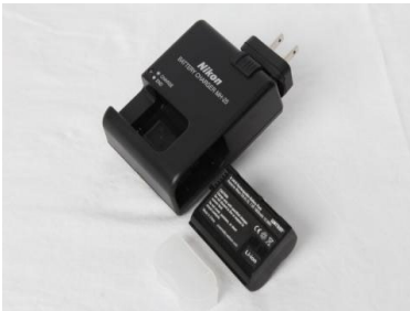
Battery charger and battery