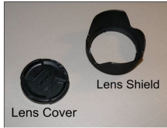
Lens Cover Lens Shield